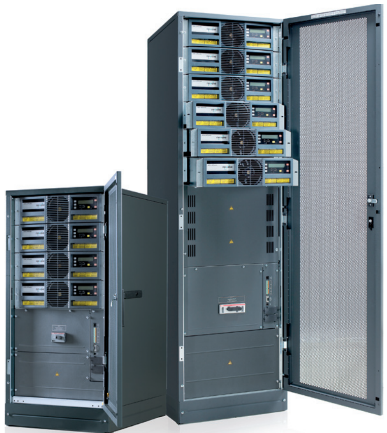
DPA UPScale ST 80